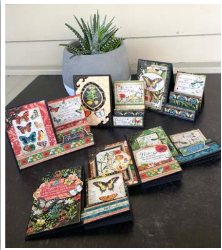
– Nature Notebook Step-Cards –