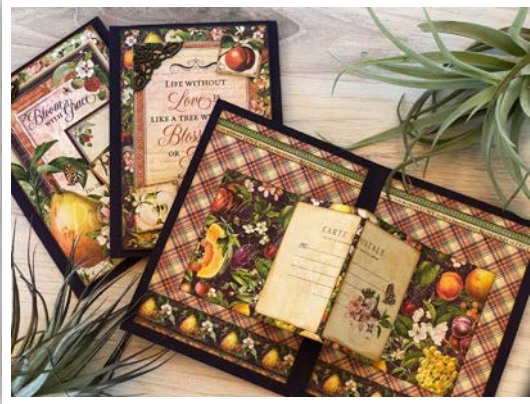
— Center Pop-Out 3 Card Set —