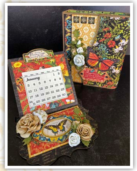
Wrap Album & Calendar –