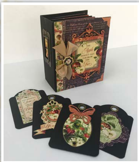
— ATC Collector's Album —