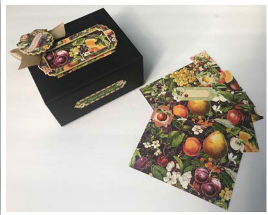
– Delightfully Delicious Recipe Box –