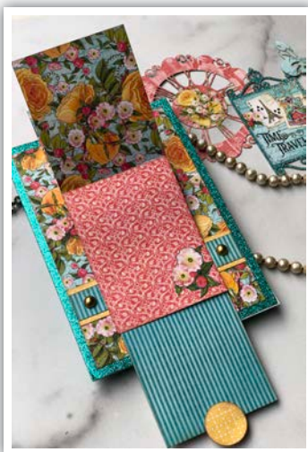
Card #1 Front Flap Detail