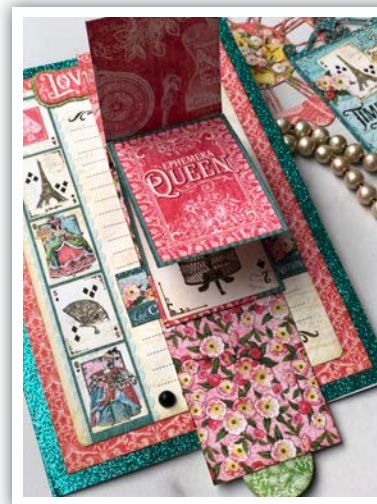
Card #2 Front Flap Detail