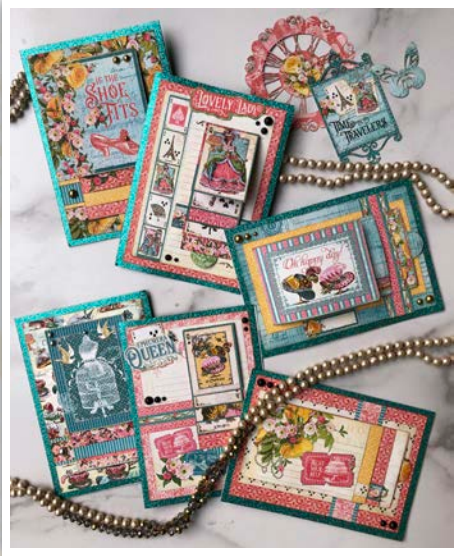
— Glitter Waterfall Card Set —