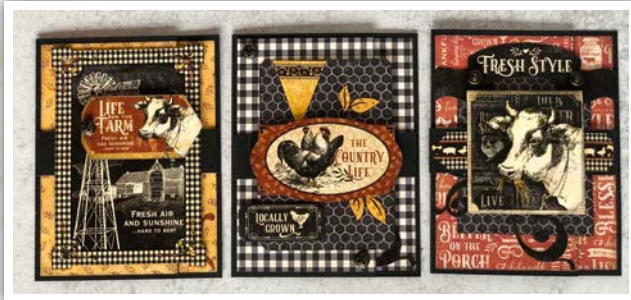
— Swinging-Gate Card Set —