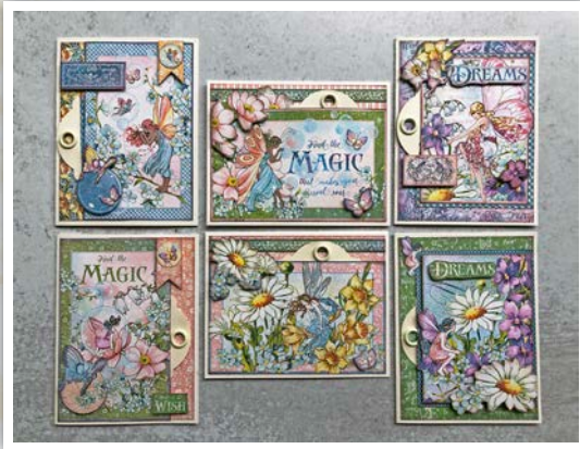
— Fairie Wings Card Set —