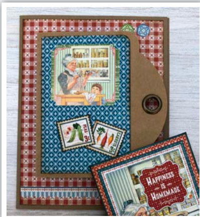
Card #1 - Front Flap