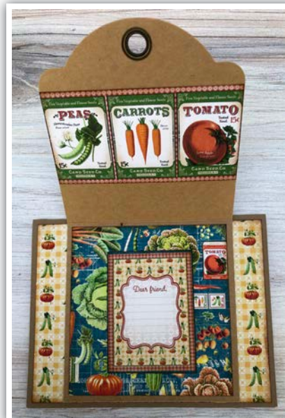
Card #2 - Inside Front Flap