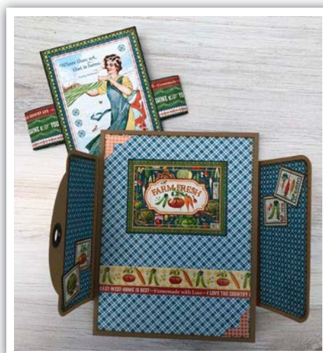
Card #3 - Inside Front Flaps