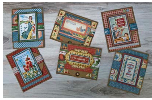
— Home Sweet Home Card Set —