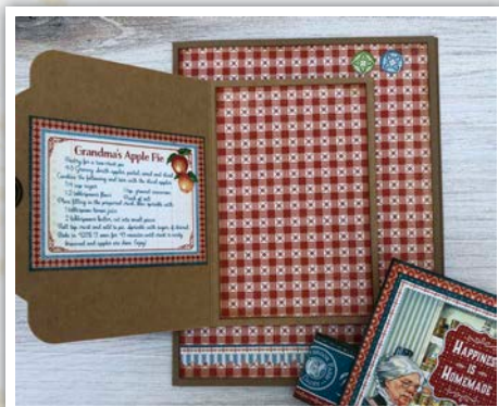
Card #1 - Inside Front Flap