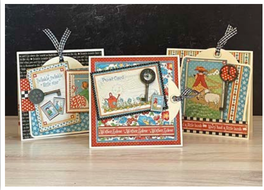
– Mother Goose Card Set –