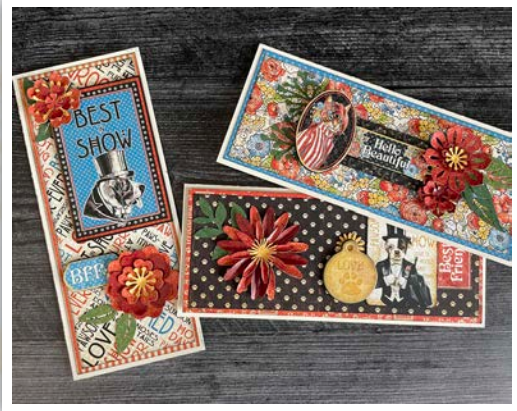
— Well Groomed Card Set —