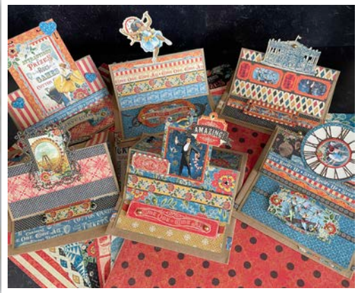
– Come One, Come All! Card Set –