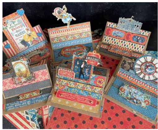
— Come One, Come All! Card Set —