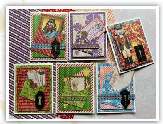
Nutcracker Sweet Card Set —