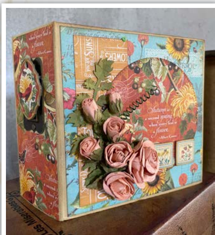
— Tag & Pocket Mini Album —