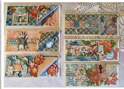
– Peel-Back Slimline Card Set –