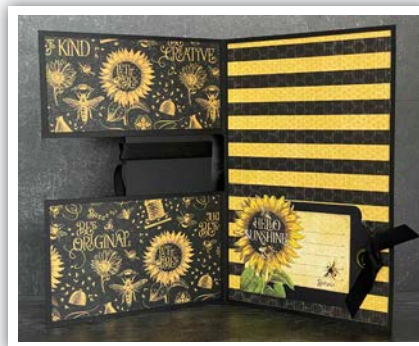
Card #3: Horizontal Card with Tag