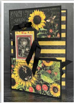
Card #2: Vertical Card with Tag