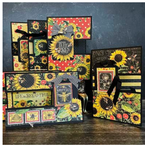
— Busy Bees ATC - Card Set—