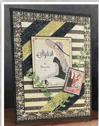
Card #3: Stylish

1. Cut a piece of Chic 4" x 5 1/4". Adhere to the card front.