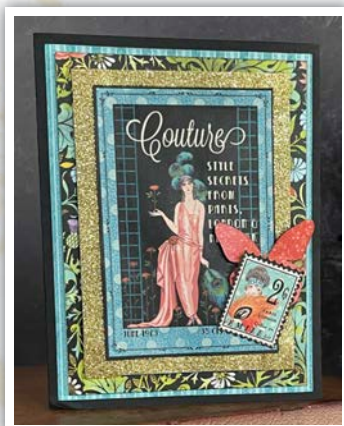
Card #2: Couture

1. Cut two pieces of Gorgeous as follows: B-side 4" x 5 1/4" and Side A 3 3/4" x 5". Adhere B-side to the card front. Pop-up A-side and add it to the center of B-side.