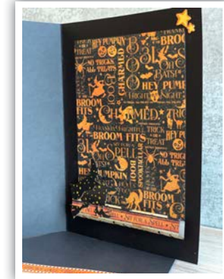
Card #3: Hey Pumpkin Horizontal Double Pop-Up