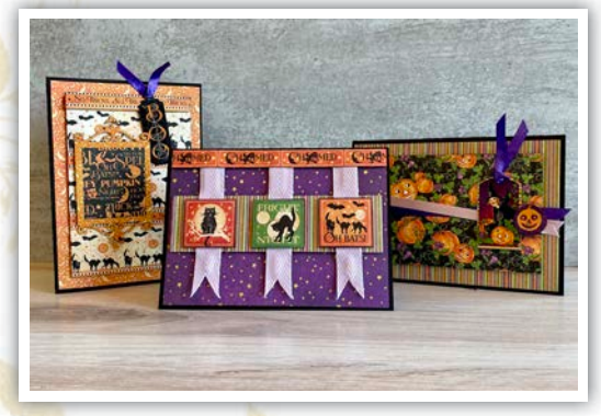
Charmed Pop-Up Card Set —