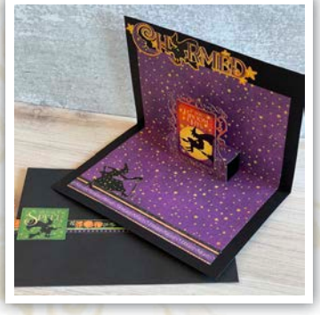
Card #2: Oh Bats Vertical Pop-Up

6. Cut a piece of "Let's Party" 6\frac{1}{2} " x 1\frac{3}{4} ". Pop up and adhere to the center front of the card. Cut three pieces of chevron ribbon, each piece about 5". Space evenly and adhere across the top of the card. Cut three images from Charmed and pop up on top of the Let's Party & the ribbon. Cut a strip of Charmed tickets and adhere across the top of the card.