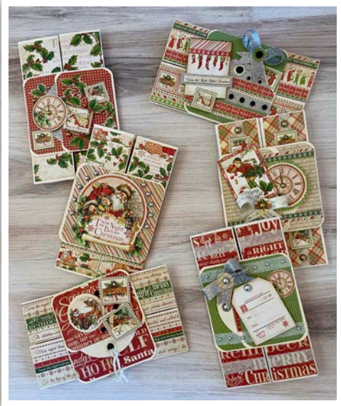
— Gatefold Card Set —