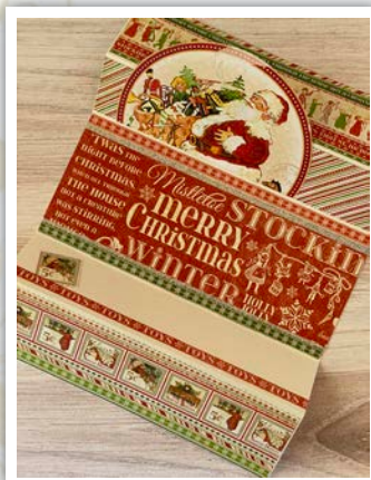
Card #2: Horizontal Gatefold Card

4. Create a band using a piece from Ho Ho Ho . Cut two pieces from 'Twas the Night Before Christmas : one 2" \times 3\frac{3}{4}" and one 2\frac{1}{2}" \times 3\frac{3}{4}" . Adhere to the tag fronts. Fit the tags around the card and glue tags together. Decorate with a clock, a "Handle With Care" tag, washi tape and silver gems. Add a washi tape bow to the band.