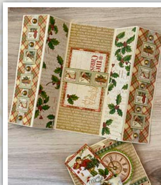
Card #3: Vertical Gate Fold with Clock

1. From Happy Holly-Day (B-Side), cut and adhere two pieces 1\frac{7}{8}" \times 6\frac{3}{4}" panels 1st and 4th. From Side A, cut two pieces for panels 2 & 3 each 1\frac{3}{8}" \times 6\frac{3}{4}" . From Long Winter's Nap cut the center panel 2\frac{3}{4}" \times 6\frac{3}{4}" .