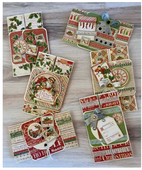
— Gatefold Card Set —