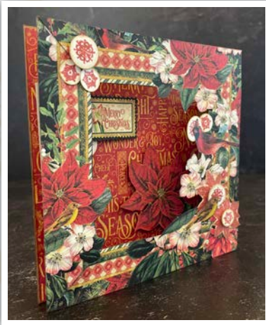
Card #2: Wonder & Joy Framed Card