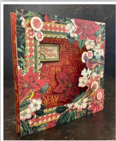
Card #2: Wonder & Joy Framed Card