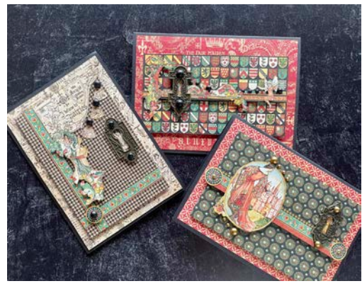
— Enchanted Forest Card Set —