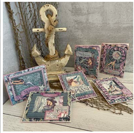
— Make a Splash Pop-up Card Set —