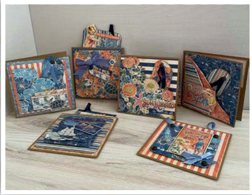
— Flip-Flop Card Set —