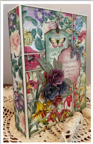
— Interactive Folio Album —