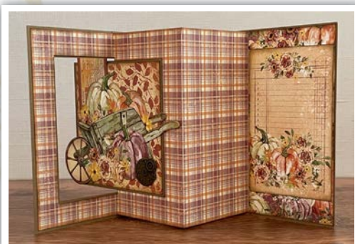
~ Card No. 2