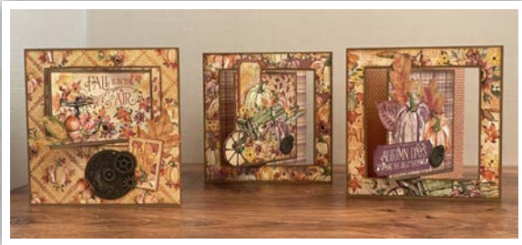
– Hello Pumpkin Interactive Card Set –