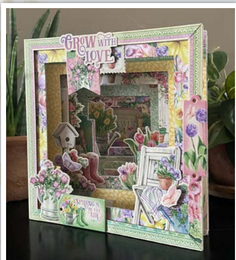
– Grow with Love – Tunnel Album –