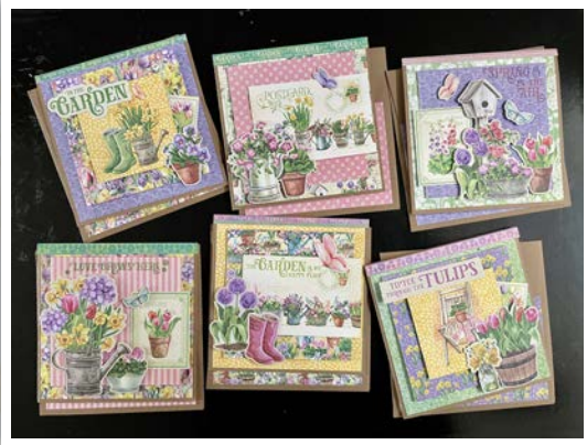
– Grow with Love Card Set –