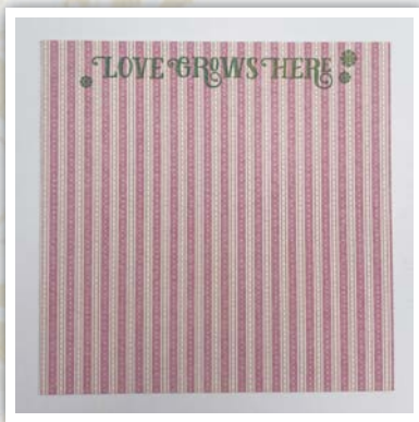
~ Card No.2 “Love Grows Here”

1. Cut your second sheet of Blooming Beauty (b-side) to 8” x 4¼”; then trim to 4¼” x 4¼”. Save leftover 3¾” x 4¼” paper for step 4. Remove “Love Grows Here” rub-on transfer image. Apply to the top of the paper.