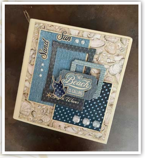
- The Beach is Calling Album -