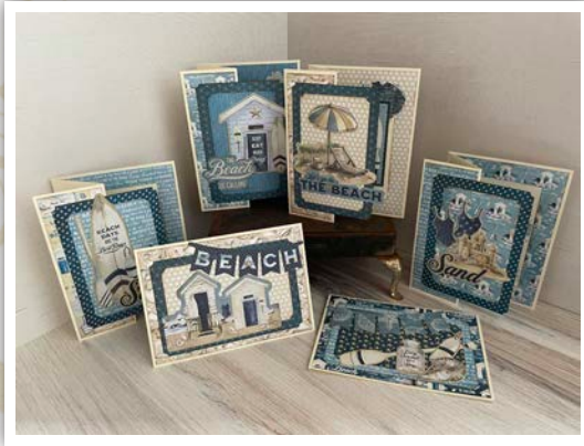
– The Beach is Calling Card Set –